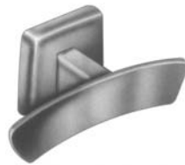
☐ 9125 Bradex® DOUBLE ROBE HOOK. PROJECTS 2-1/4"