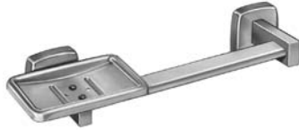
☐ 9035 HORIZONTAL TOWEL BAR WITH SOAP DISH 10-1/4"W x 3-1/8"D