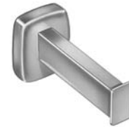
☐ 9315 TOWEL HOOK. PROJECTS 4-1/8"