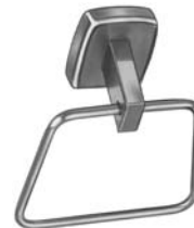
☐ 9335 TOWEL RING. PROJECTS 2-3/8"