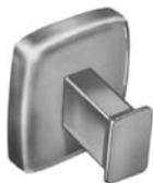
☐ 9115 Bradex® SINGLE ROBE HOOK. 2"W x 2"D