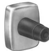
9144 DOOR STOP. PROJECTS 2-1/8"