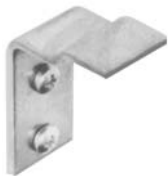
9111 CLOTHES HOOK. 1"W x 2-1/4"H x 1-1/2"D