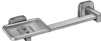
9034 HORIZONTAL TOWEL BAR WITH SOAP DISH 10-1/4"W x 3-1/8"D