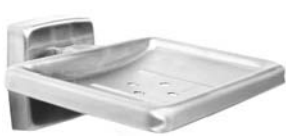
9014 Bradex® SOAP DISH WITH DRAIN HOLES