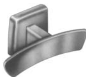
9124 Bradex® DOUBLE ROBE HOOK. PROJECTS 2-1/4"