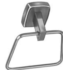
9334 Bradex® TOWEL RING. PROJECTS 2-3/8"

Orders composed of products indicated as Bradex® will be available to ship in one week after receipt of order at the factory. There is no pricing penalty for this service from Bradley.